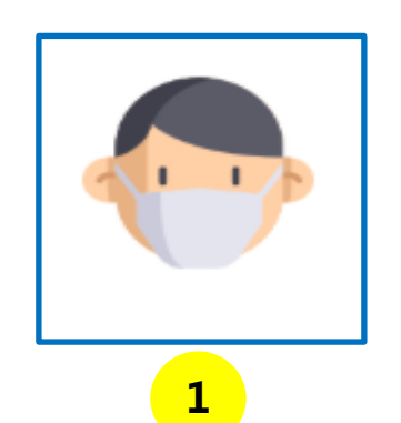
戴口罩 Wear Surgical Mask At All Time