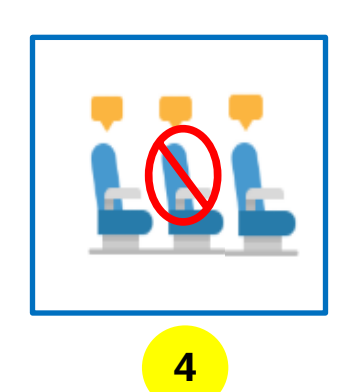
<u>分散座位/難位</u> More Space Between Seats, Booths And Wider Aisle